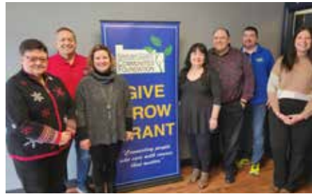
FRED DAFLER & RICK HADDIX SCHOLARSHIP Established January 2024

The Matt McCabe Memorial Fund seeks to support students at Sandusky County Schools and Colleges in easing the required costs of non-classroom experiences. The fund will provide money to education institutions to allocate to students in need.