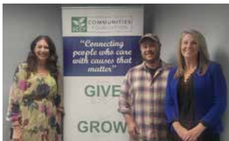
DR. DONALD R. KNEPPER MEMORIAL SCHOLARSHIP FUND Established July 2024

This fund represents a powerful way for corporations like Crown Battery to streamline their charitable contributions, setting a clear philanthropic strategy for the year while supporting causes that align with their values.