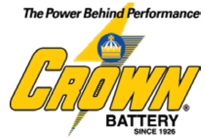
CROWN BATTERY MANUFACTURING COMPANY FUND Established May 2024

This scholarship was established to support a full-time student enrolled in higher education or career and technical educational. The candidate must be a member or a relative of a member of the Ohio Track and Field and Cross Country Officials Association.