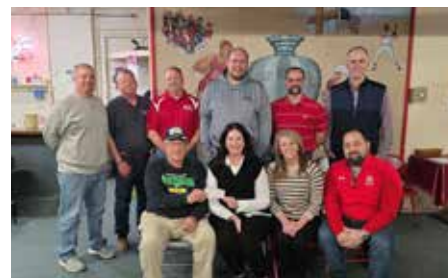
SJCC ATHLETIC BOOSTER CLUB ORGANIZATIONAL ENDOWMENT FUND Established December 2024