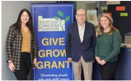
MATT MCCABE MEMORIAL FUND Established January 2024

The Matt McCabe Memorial Fund seeks to support students at Sandusky County Schools and Colleges in easing the required costs of non-classroom experiences. The fund will provide money to education institutions to allocate to students in need.